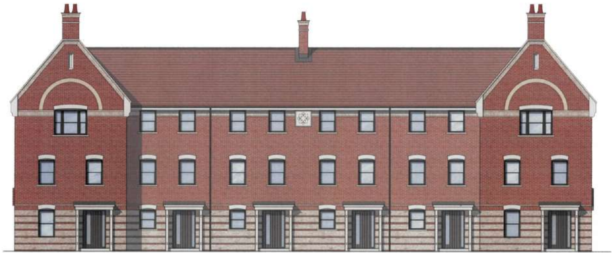
Countryside (Vistry) Existing design