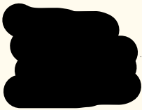
Pam Cox MP